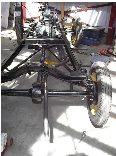
Photo at left is looking from the rear. Note the pipe crosses over and is supported at the frame, just like the stock muffler. The tail pipe is clamped to the rear of the muffler. We provide a short stub on the back of the muffler for this connection.

Note: the pipe in the photos was a prototype and thus some areas are not painted. Our production pipes are all mandrill bent sections, welded together and painted with high temperature paint.